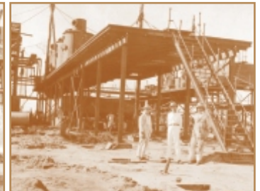
Snapshots of the Simbhaoli sugar plant under construction, circa 1933