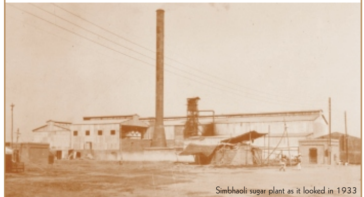
Simbhaoli sugar plant as it looked in 1933

Simbhaoli Sugar Plant Celebrates 75 years of Innovation & Excellence