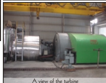
A view of the turbine