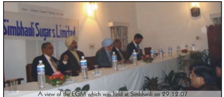
A view of the EGM which was held at Simbhaoli on 29.12.07